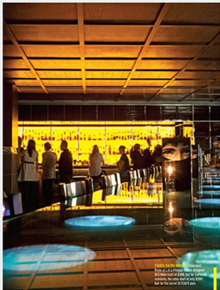
STARBUCKS WINDS UP Just east of L.A.'s Palms, this design SLS hotel (start at $300, but in California months, the rates start at only $200. Ask for the new SLSCA plan.