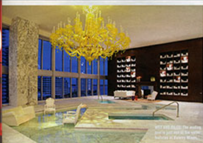
WET AND DRY: The modern pool is just one of the amenities at Eden Roc.

OUR ULTIMATE OSCAR QUIZ THE BAG LADIES OF RODEO DRIVE BARON DAVIS' DOCU DREAMS FETA, SHISO, MISO, MANGO: THE NEXT FAST FOOD?!